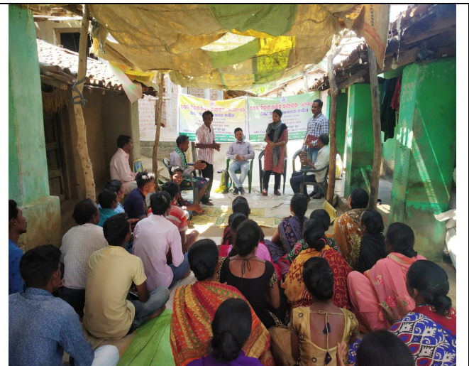
Craft Village Programme in Terracotta Craft at Dhanpur of Kalahandi District