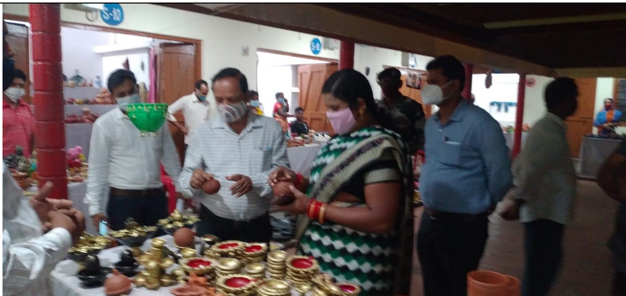
Exhibitions organized at Renovated Ekamra Haat, Bhubaneswar