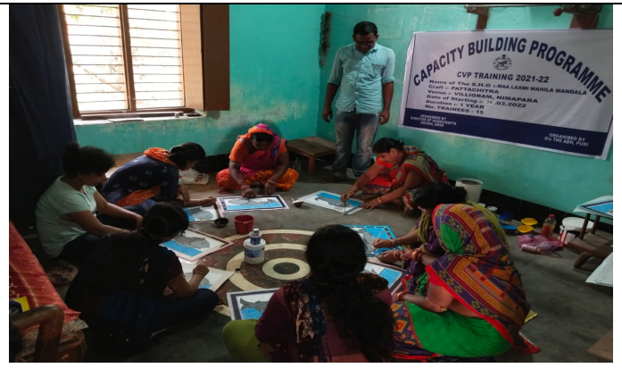
Craft Village Programme in Pattachitra Craft at Villigram, Nimapara of Puri District