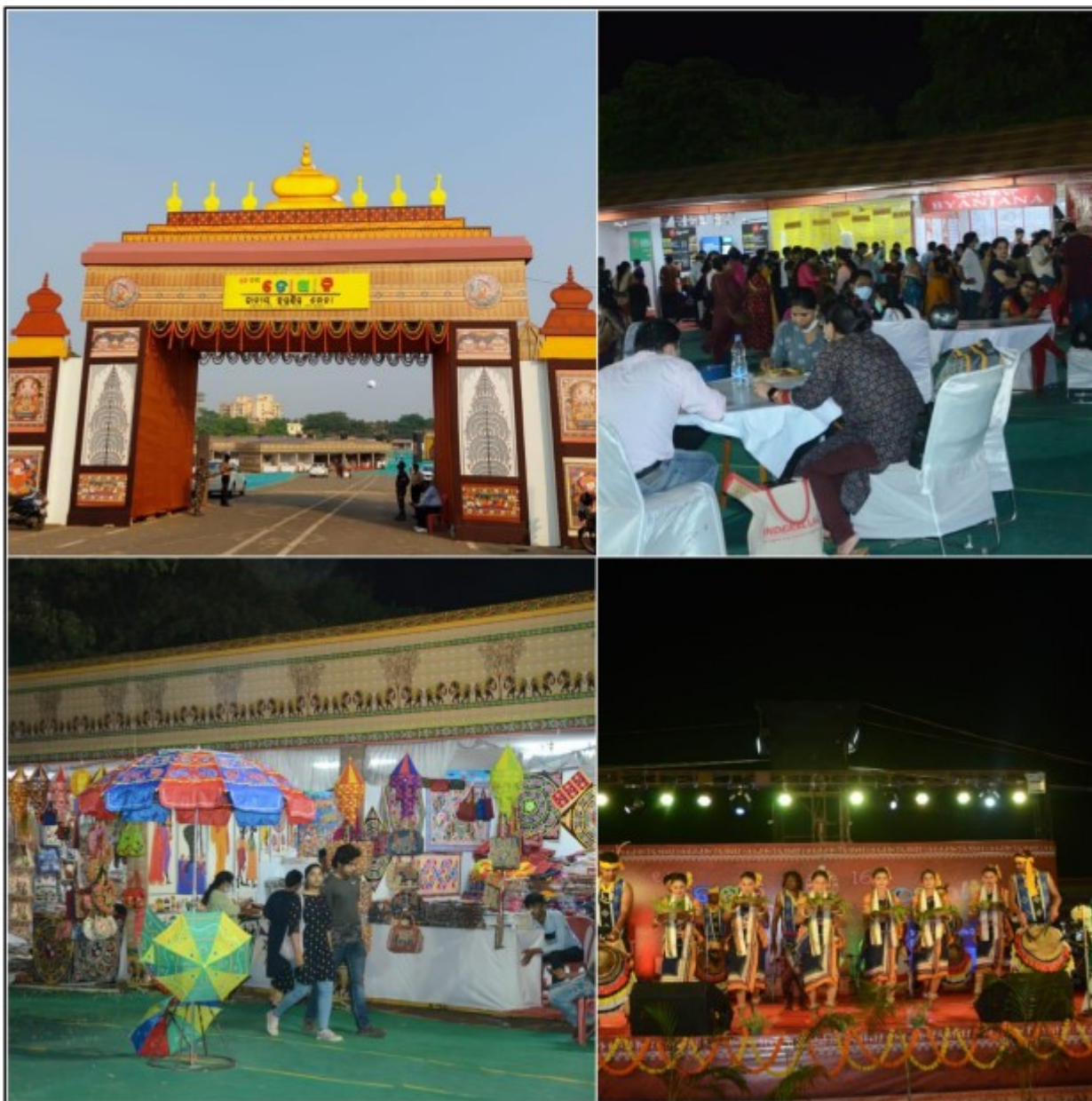
16 th Toshali National Crafts Mela - 2022 at Janata Maidan, Bhubaneswar from 28.03.2021 to 10.04.2022

b) Organisation of Toshali National Crafts Mela: SIDAC organised 16 th Toshali National Crafts Mela - 2022 at Janata Maidan, Bhubaneswar from 28.03.2021 to 10.04.2022. 465 artisans and weavers from all over the country participated in the fair for display & sale of handicrafts & handlooms. Total sales made in the fair are Rs.16.12 Crore. Around 20.00 lakh visitors visited the Fair.