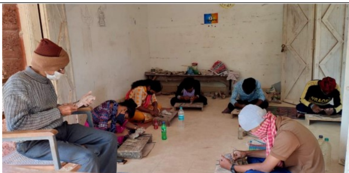
District Level Institutional Training