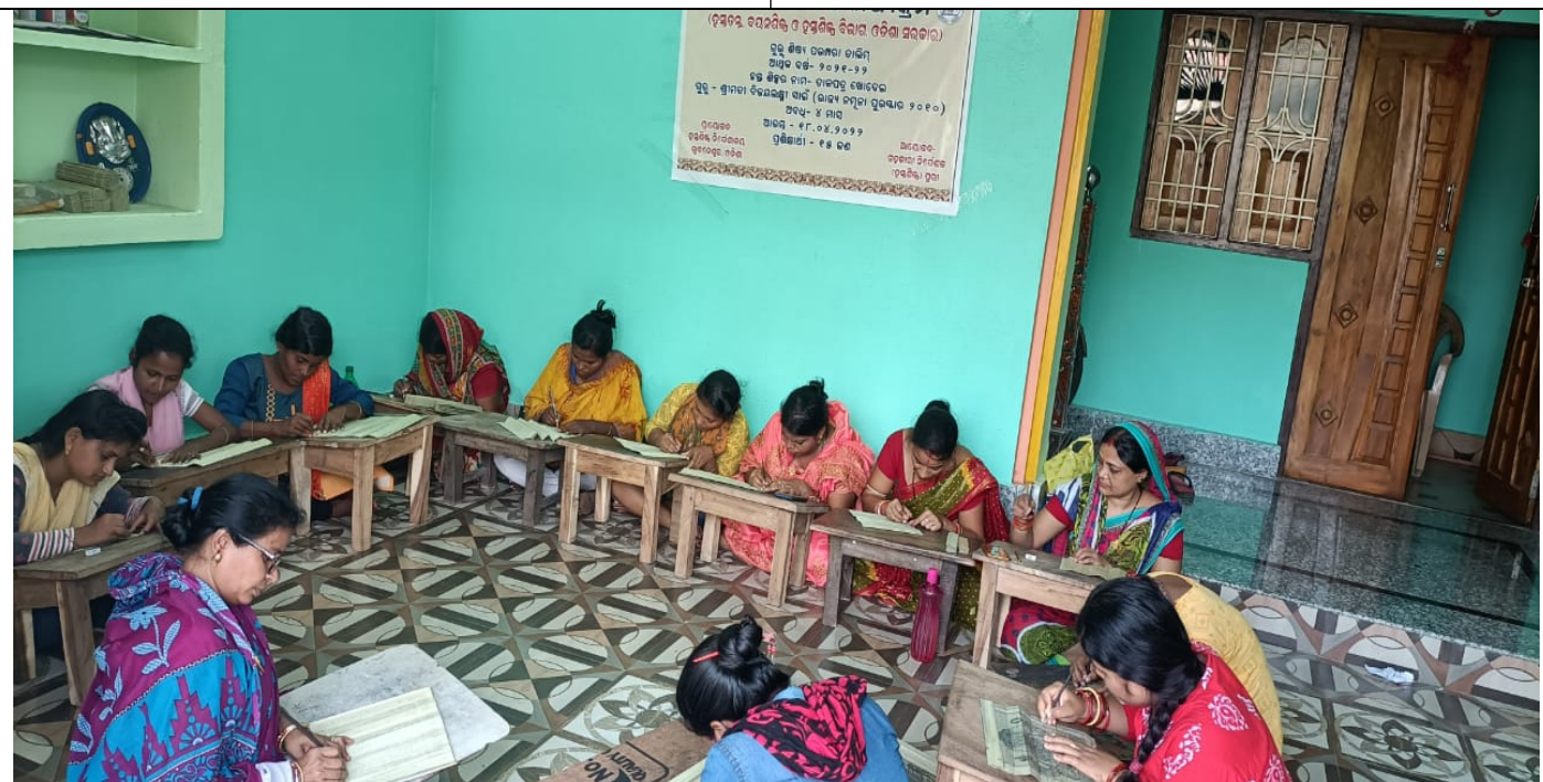
Guru-Sishya Parampara Training Programme in Palm leaf Engraving craft at Basudeipur, Chandanpur of Puri district