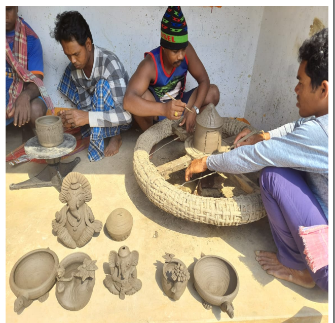
MCM Training Programme in Cane Craft at Kainpur, Block- Rayagada, Gajapati