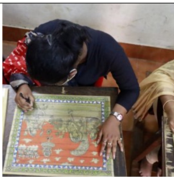
Institutional Training at SIDAC, Bhubaneswar