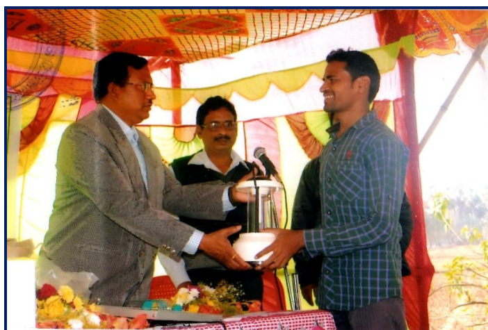
Distribution of Solar Lanterns to Artisans

The scheme “Distribution of Solar Lanterns to Artisan Households” was introduced as part of Chief Minister’s Package to minimize stress on artisan’s eyes as support to their continuous works so that they can work for more time to increase productivity for their sustained livelihood.