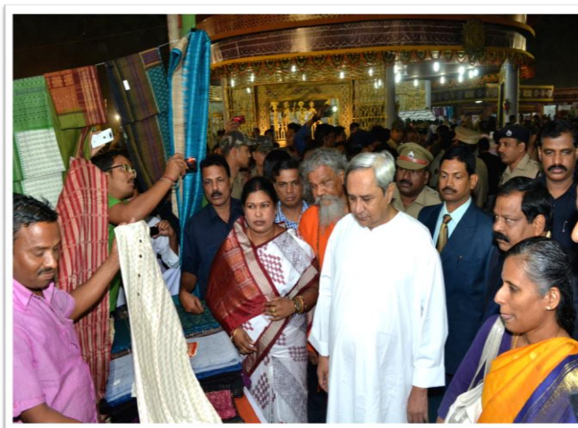
Toshali National Craft Mela-2014