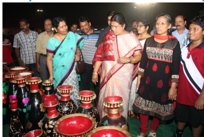
Hon'ble Minister Visiting a Stall During Mruttika

During 2014-15, 1938 handicraft artisans have participated in about 91 different exhibitions organized at the district level, state level and outside the state exhibitions and sales turnover was around Rs.998.45 lakh.