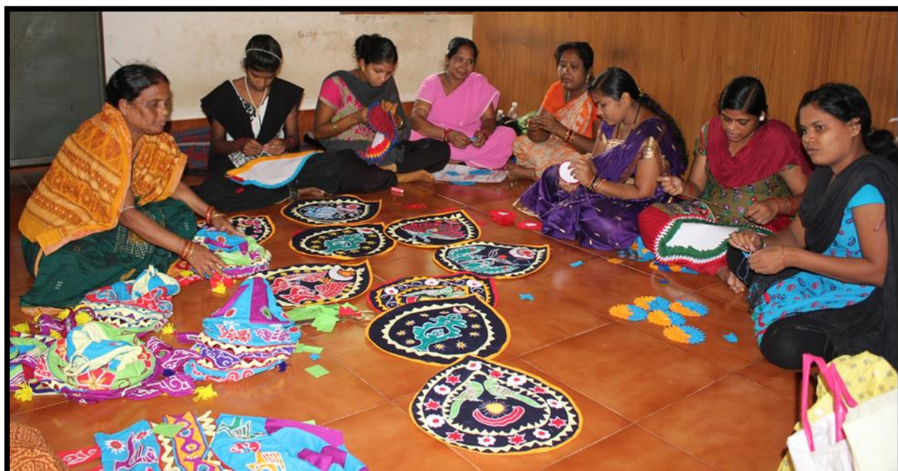
Artisans undergoing Skill Training in Applique Craft